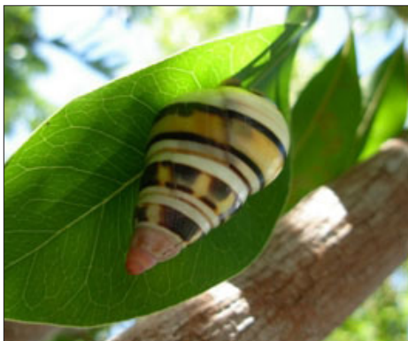
Liguus tree snails are a special sight throughout this area.

The Loop Road Education Center is operated by Everglades National Park for educational groups with reservations. Across the street on the north side, the Tree Snail Hammock Trail is maintained by Big Cypress National