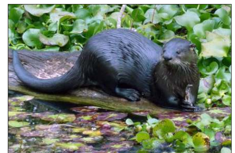
The elusive river otter is one of many creatures that call Big Cypress National Preserve home

This section of Loop Road has many small culverts. Depending on the time of year, these may dry up as water levels drop during the winter. Not only to protect the road from washing out, these culverts allow a more natural flow of water southwards. The Preserve's