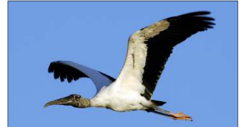
The locally endangered wood stork may often be spotted along Loop Road.

The midpoint of Loop Road is marked with signs. There is also another large culvert here with alligator flag. You know what that means: keep an eye out for alligators!