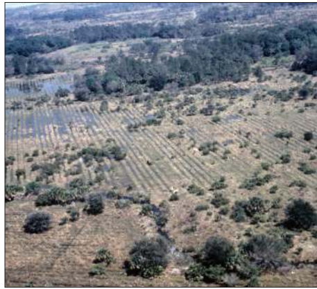
Nearby abandoned plowlines.

Into the mid-1900s, the Big Cypress Swamp and the Everglades were considered swampy wastelands by many. Efforts were made to “tame” the region – including the construction of roads, such as this one, canals to drain the swamp, and levees to control flooding. An aerial view of today's Preserve still shows evidence of farming attempts – some prairies have the tell-