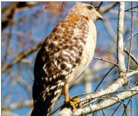
Red-shouldered hawk surveying the area for its next meal.

Look east to see a sawgrass prairie, with a cypress strand visible beyond. The sawgrass is a dominant prairie species, but ironically it is not grass, it is sedge. Prairies are flooded for less time out of the year, on average, than the slightly lower regions which have cypress trees. Every inch of elevation change counts in the Preserve. These open regions are often good spots to search for raptors, birds of prey that tend to perch in prominent locations such as atop standing dead trees. Drive another mile for a second sawgrass prairie.