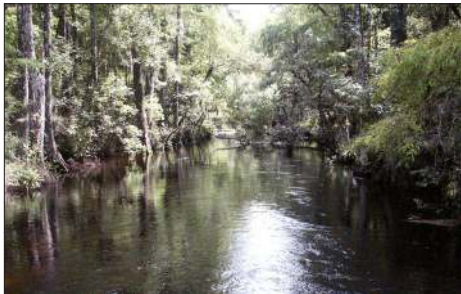
Sweetwater Strand is a popular spot along Loop Road.

The large trees provide a wind-break and shelter to many other organisms. Feel how the air is cooler, and moist? There is usually wildlife as well – both alligators and birds know this is a good source of fish, and the branches above