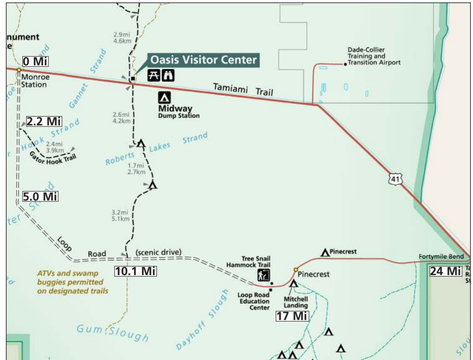
Map of the Loop Road Scenic Drive starting from the intersection of Hwy 41 and Loop Road at Monroe Station. Mileages are indicated in a counter clockwise pattern.

Four miles west of Oasis Visitor Center, or 15 miles east of the Big Cypress Swamp Welcome Center, Monroe Station is one of the original buildings along Tamiami Trail. Completed in 1928, or 1929, as one of six service stations built at regular intervals along the road to assist travelers - providing gasoline, refreshments, and assistance for broken-down vehicles. In later years, it was also a tavern and roadside inn. The historic building has stood through many eras and is now closed due to structural problems. It marks the northwestern end of Loop Road, and today is used as a parking area for off-road vehicles. There are off-road vehicle trails here that go both north and southwest into the Big Cypress backcountry. These trails are primarily for the use of all-terrain vehicles and swamp buggies – vehicles often built by their owners and specially