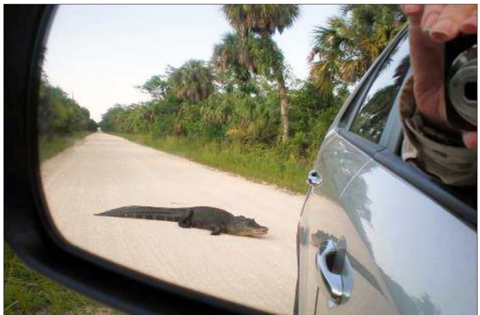
Remember, the Preserve is their home and you are the guest. Respect wildlife and observe from a safe distance.